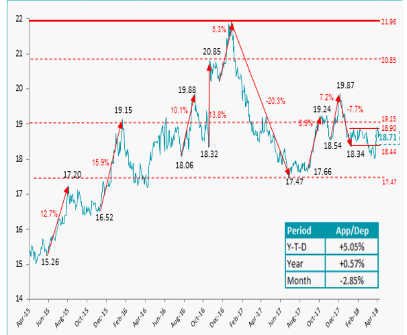
Exhibit 4. MXN/USD Spot Exchange Rate. As of April 30, 2018.