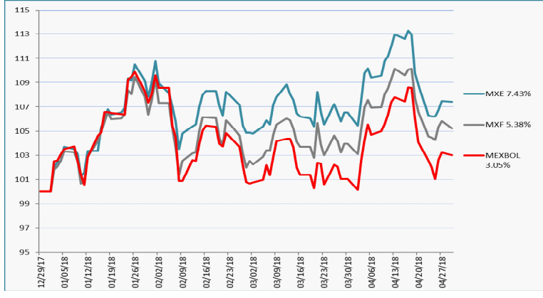
Exhibit 7. MXE YTD Performance vs. Benchmarks. As of April 30, 2018.