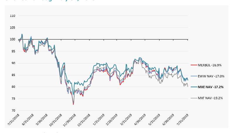
Exhibit 5. MXE Performance Comparison vs. Benchmarks. One Year through July 31, 2019.

Past performance is not a guarantee of future results.