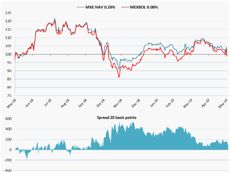
Exhibit 5. MXE Performance Comparison vs. MEXBOL Index. One Year through May 31, 2019

Past performance is not a guarantee of future results.