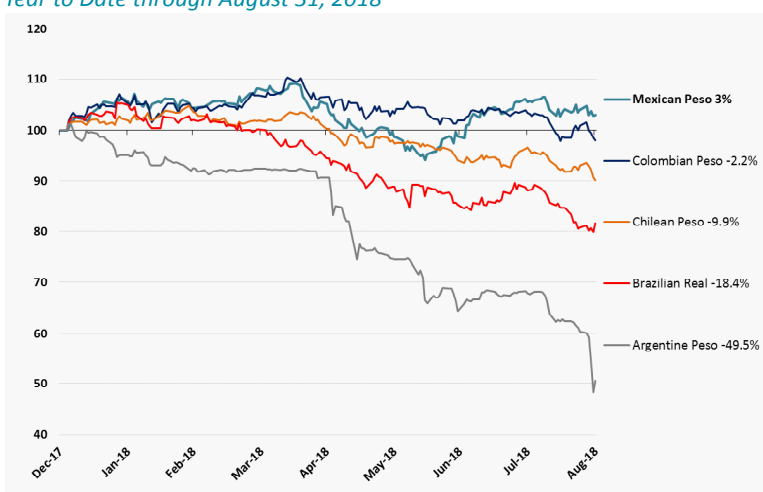
Exhibit 5. LatAm Currencies Performance vs. U.S. Dollar. Year to Date through August 31, 2018

Emerging Markets are facing difficult times due to poor management of public finances, political disorders, and protectionist measures, while Mexico's orderly government transition improved the outlook for the Mexican economy.