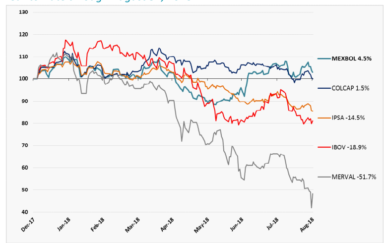
Exhibit 6. LatAm Markets U.S. Dollar Performance Comparison. Year to Date through August 31, 2018