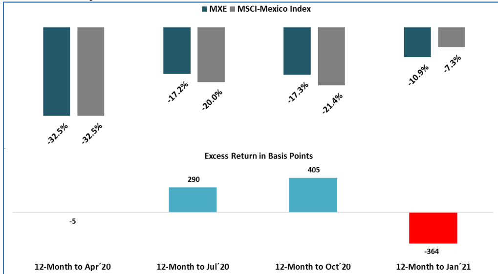
Exhibit 5 Cumulative 12-Month Performance As of January 31, 2021